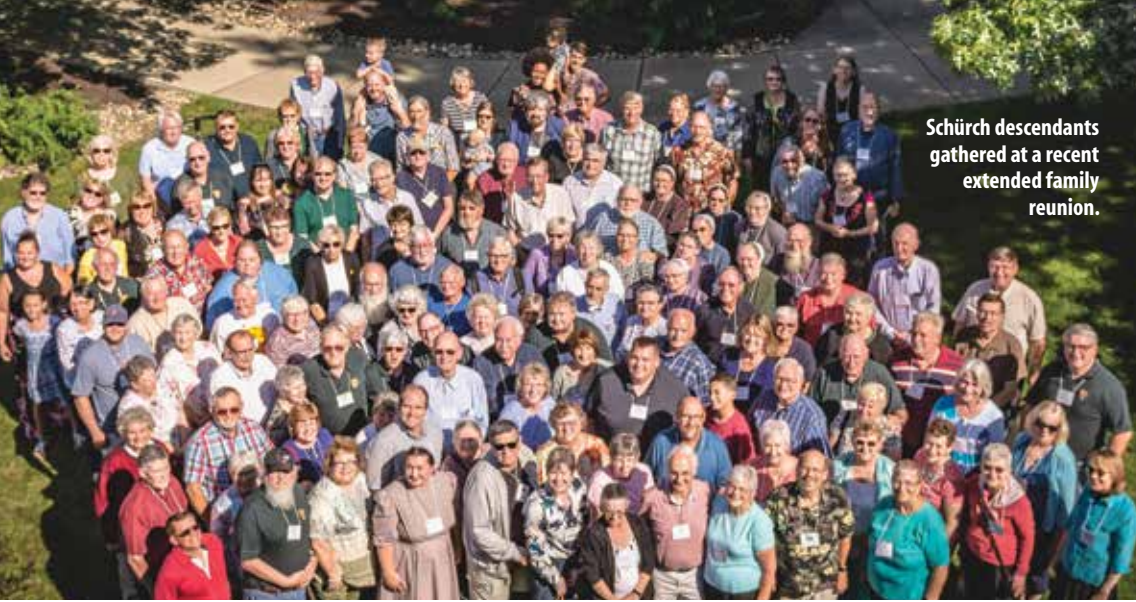
Schürch descendants gathered at a recent extended family reunion.

Helping people of faith explore, experience, and expand their world