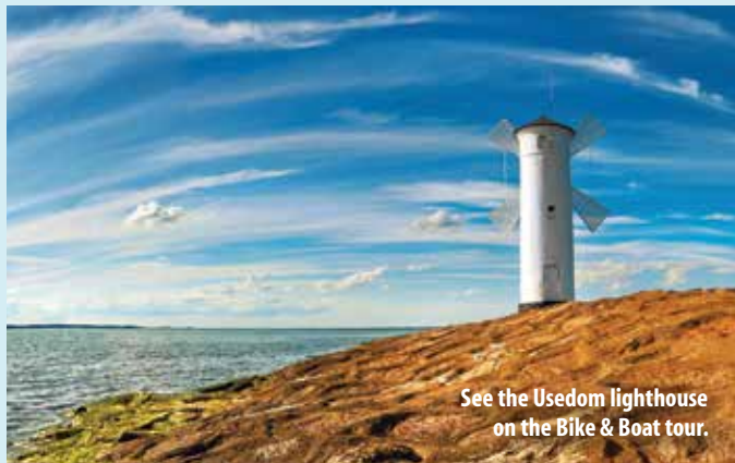
See the Usedom lighthouse on the Bike & Boat tour.