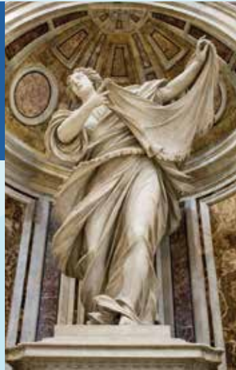
Travel on the Italy: Bella Terra Tour to see sculptures in Vatican City, Rome.

Can be paired with Oberammergau Passion Play