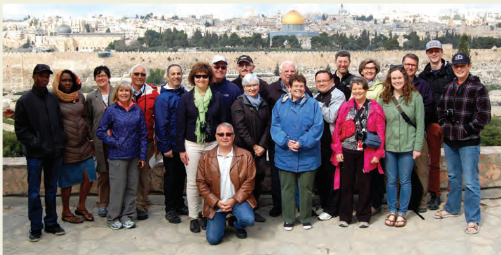
A group on a custom tour to the Holy Land with Thorneloe University College and the Algoma Diocese (Anglican Church of Canada) on the Mount of Olives overlooking Jerusalem.